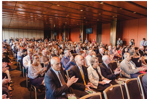
Parliamentary Celebration of SRE